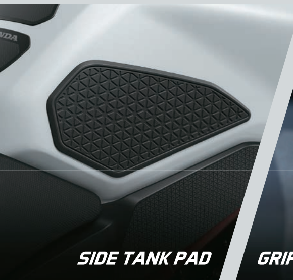
SIDE TANK PAD