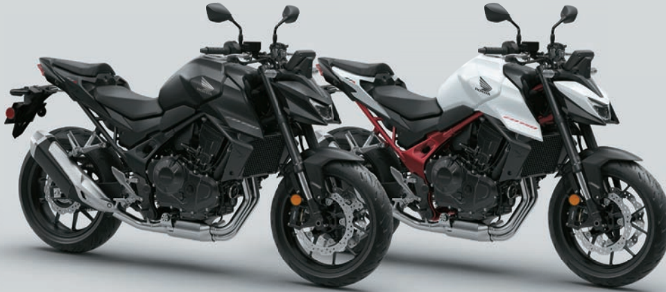
MATTE BALLISTIC BLACK METALLIC