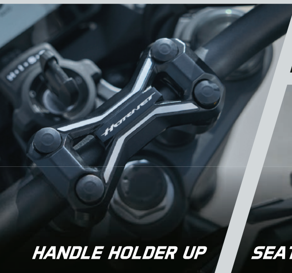
HANDLE HOLDER UP