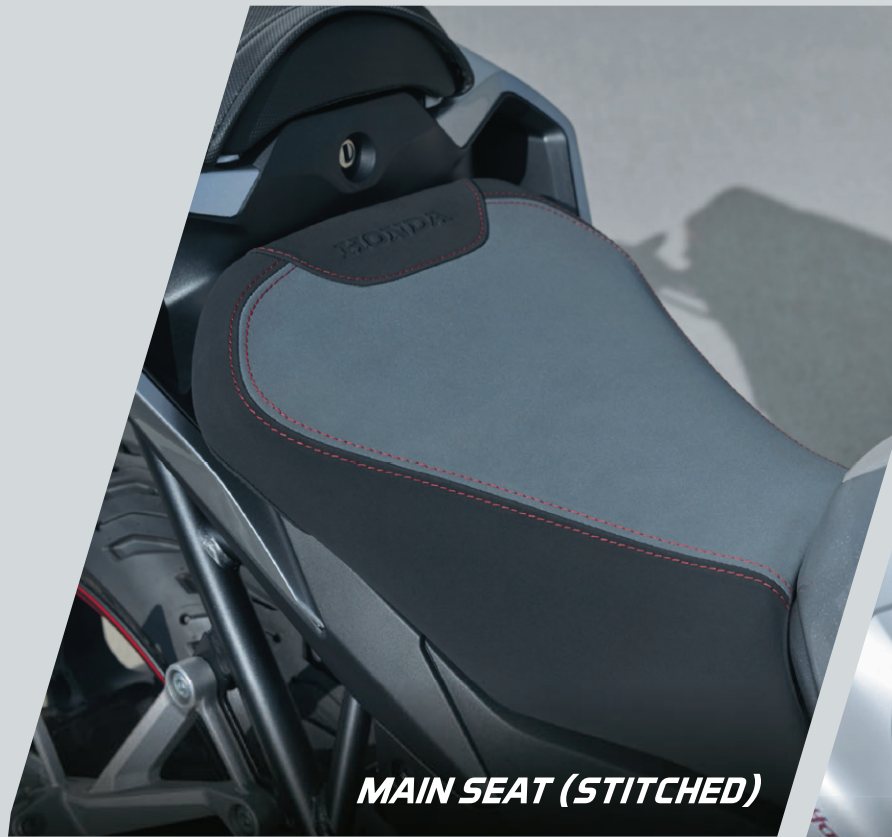
MAIN SEAT (STITCHED)