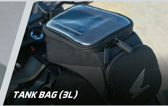
TANK BAG (3L)